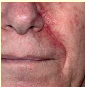
Treatment day 7

The AK patient below was treated with Efudix Cream once daily for 28 days.