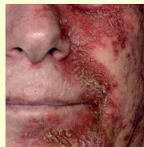
Treatment day 21