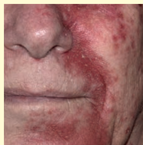
Treatment day 14